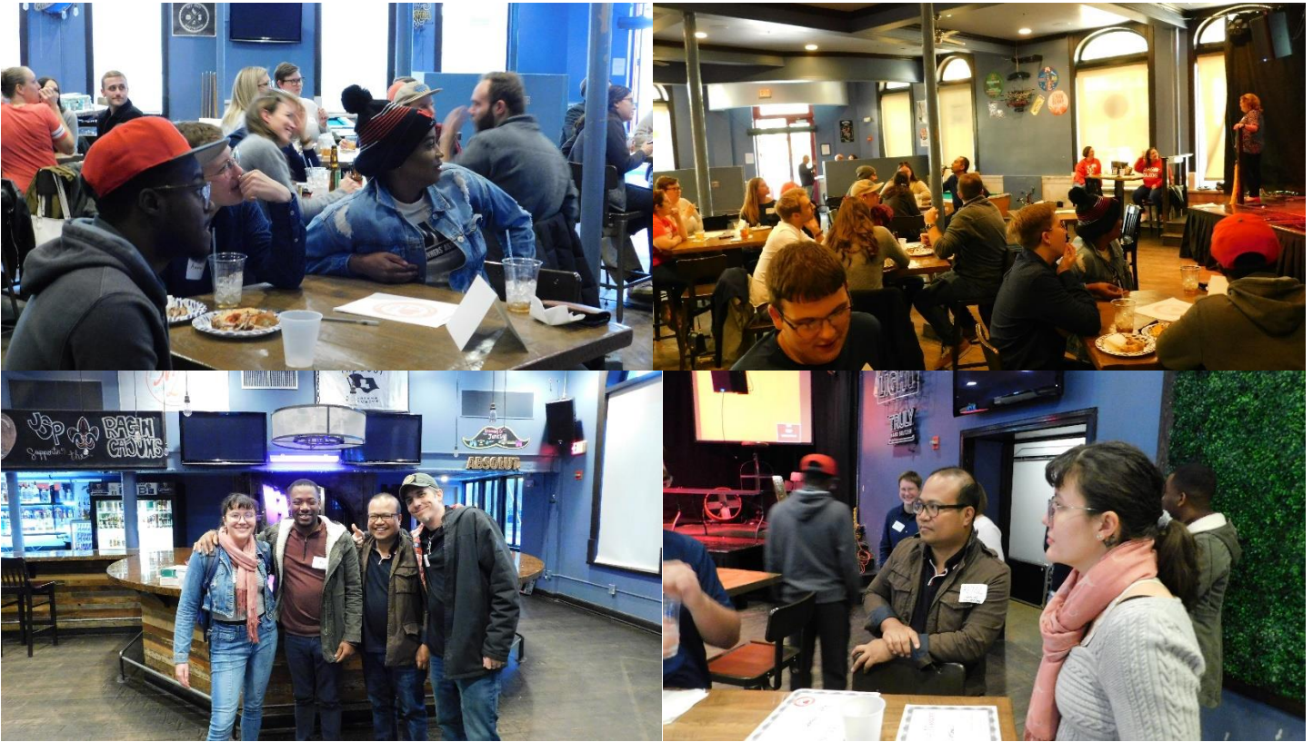
Grad Trivia Night Photos, Courtesy of GSO and The Graduate School